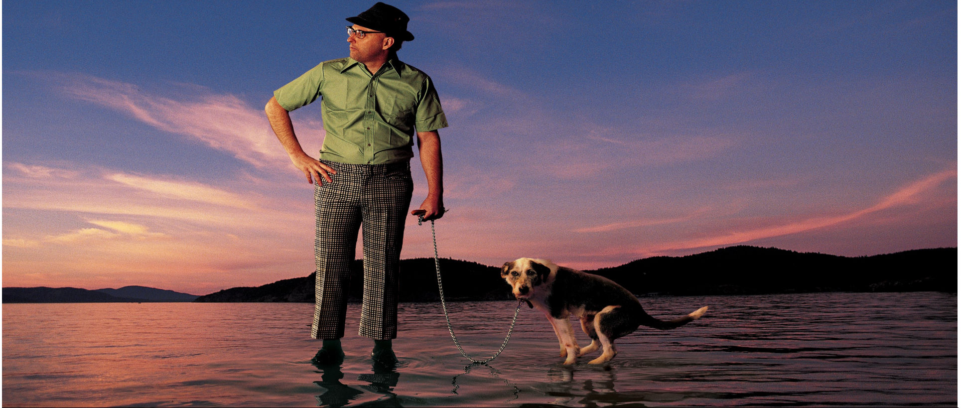
Image and text reprinted with permission from the Puget Sound Action Team, Department of Ecology, King County, and the cities of Bellevue, Seattle and Tacoma WA

When our pets leave those little surprises, rain washes all that pet waste and bacteria into our storm drains. And then pollutes our waterways. So what to do? Simple. Dispose of it properly (preferably in the toilet). Then that little surprise gets treated like it should.